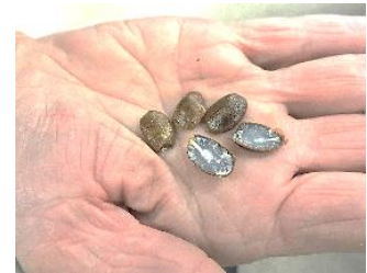
Seed showing a spoon predict more than usual snow for the winter of 2016 in Mississippi.

The wood is hard, strong, heavy, close grained and excellent for turning on a lathe. Uses include pool cues, drumsticks, and golf club heads. It is in the Ebenaceae with ebony but not as dark, with a variety of color variants. Sapwood tends to be tan while the heartwood is dark brown. It is difficult to cure, somewhat prone to shrinkage and checking. Persimmon with worm holes has interesting patterns, making it very desirable. Some think the worm holes reduce the potential for cracking. If you are a wood worker, you will love persimmon! The seeds were used as buttons during the war between the states.