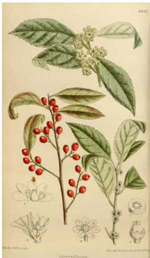
From: Curtis's Botanical Magazine, 1920, London., vol. 146 [= ser. 4, vol. 16]: Tab. 8832 - [1]. Matilda Smith del., John Nugent Fitch lith.

Ilex verticillata is a medium to large, deciduous shrub native to the Eastern United States. Despite its deciduous nature, this species is a favorite winter plant of many. As its most prevalent common name, winterberry, suggests, this species, or at least the females, provide an abundant display of bright red fruit during the traditionally dormant season. The displays of bright red drupes begin in late summer or early fall. If the numerous species of birds that consume the berries do not denude the plants they persist into winter, where they make a spectacular showing after leaf senescence. The fruits have a lower fat content than other fall and winter fruits, so they are usually not consumed until the fattier sources have been exhausted. The leaves rarely present even decent fall color, but they don't need to as the fruit is the show stopper. After the first hard frost of the season the leaves turn black or dark brown, which lends the common name black alder. They then quickly fall, revealing the spectacular veil of berries.