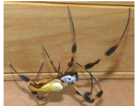
Golden silk orb weaver.